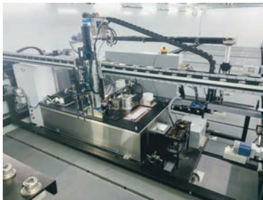
Sample management system